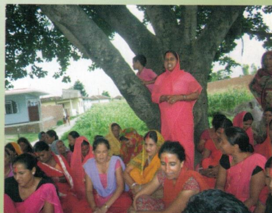
Durga Samuha Women Group of Hariyon, Sarlahi

Women farmers despite having traditional skills need new expertise and knowledge for increasing production both in quantitative and qualitative terms. Moreover, they need an efficient and effective marketing mechanism to optimize the benefits of their products. WPD-Nepal merges micro credit interventions with agro based entrepreneurship through the Socioeconomic Empowerment Program for Women and Marginalized Program (SEWAM). The project which is supported by World Accord, Canada has been implemented in 12 Villages of three districts (Sarlahi, Makwanpur and Chitwan) of Central Development Region.