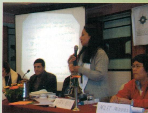
Launching of South Asia Peace Makers Regional Network