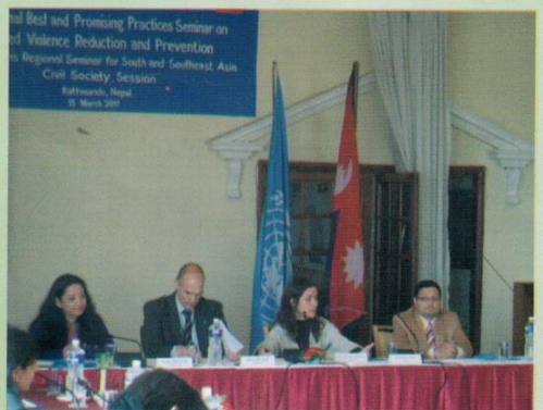
WPD Nepal hosting United Nation's Regional Seminar, 2011