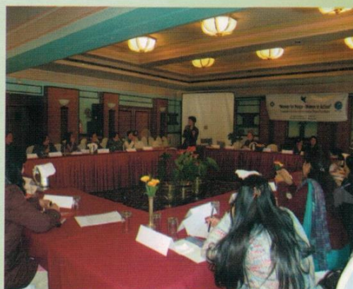
Launching of South Asia Peace Makers Regional Network