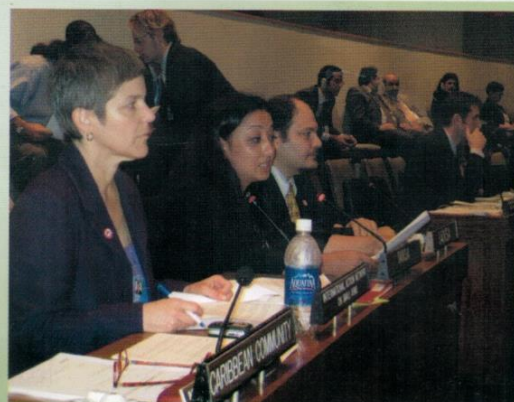
Shobha Shrestha representing Nepal at United Nations