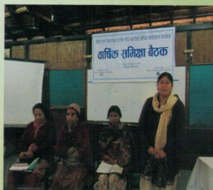
SEWAM Program First Annual Meeting