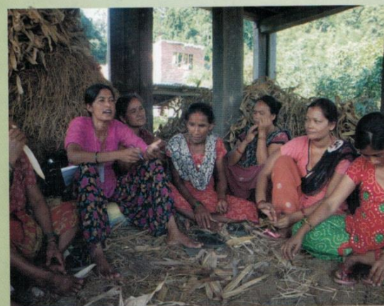
Parijat Women Group, Basamadi, Makwanpur