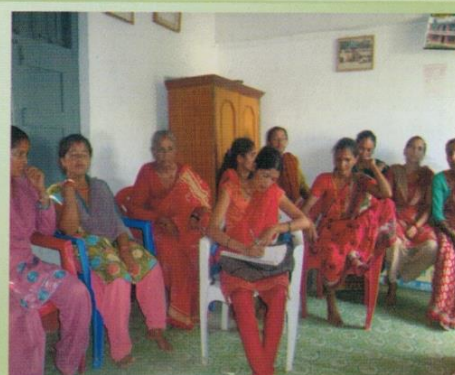
Experience sharing meeting, Kumroj, Chitwan