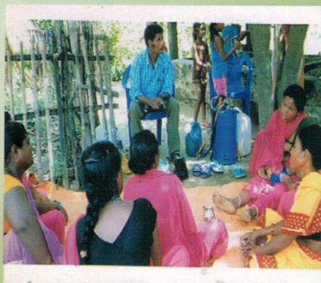
Organic Farming Training, Haripur, Sarlahi