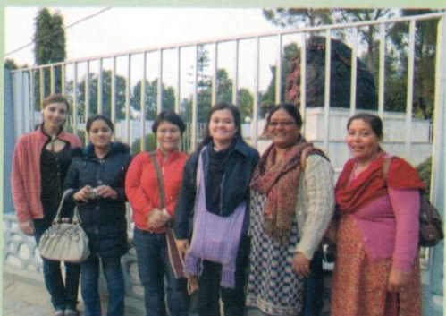
Peacemakers visit to Makwanpur community